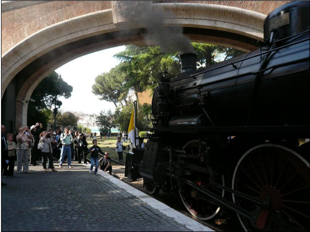
Rome: 1932 papal train ready to cross the Vatican City wall for a heritage tour to Orvieto.