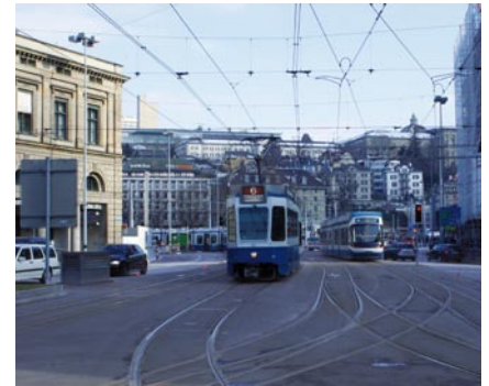
Integrated public transport in Zurich, Switzerland

In any one place, there may be a number of options. From a European perspective, the conventional planning wisdom is that a reasonably high density, a mix between housing and employment uses, and a degree of self containment are among the pre-requisites for low carbon areas. But how universally valid is such a vision? Also, given that sustainability has economic and social, as well as environmental dimensions, how should we set the priorities, or are there genuine 'win win' strategies