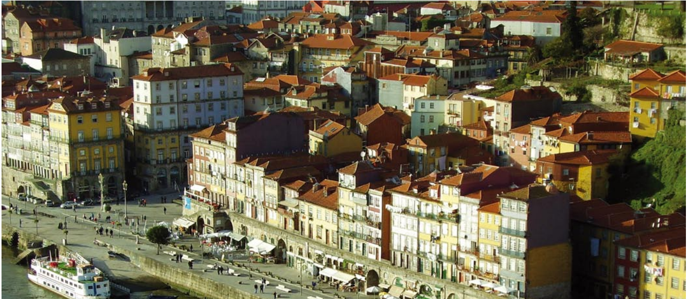
Old Porto riverside

A message from ISOCARP about its 45 th World Congress to be held in Porto, Portugal between 18 -22 October 2009