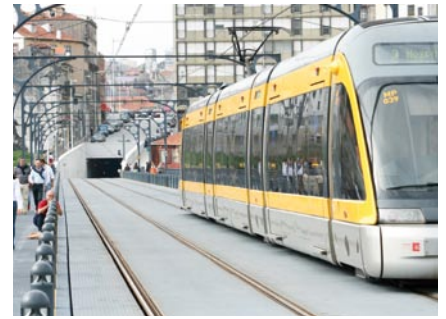
The Porto metro