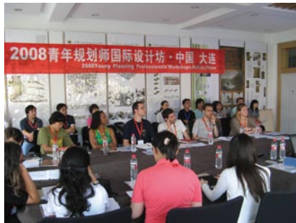
YPP Workshop in Dalian, China

Over a concentrated period of three to four days, the YPPs work in closely-knit international teams, exchanging ideas and learning from each other. The workshops, thus, provide a synergetic platform where new ideas and creative solutions to complex and multifaceted urban issues are produced. The tangible results are then published in a Workshop Report. The intangible ones, however, stay in the hearts and minds of the participant YPPs, who not only learn from each other but make life-long friends.