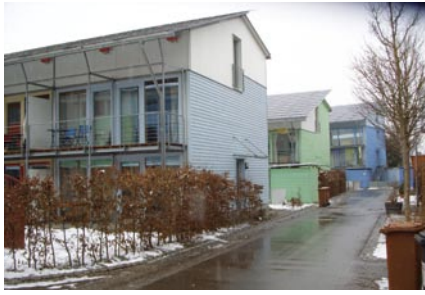
Solar housing in Freiburg, Germany

strategies, as well as action to combat the growing incidence of heat islands in dense cities where the priority is to keep the city cool. Porto's own sustainable energy action plan will provide an important case study.