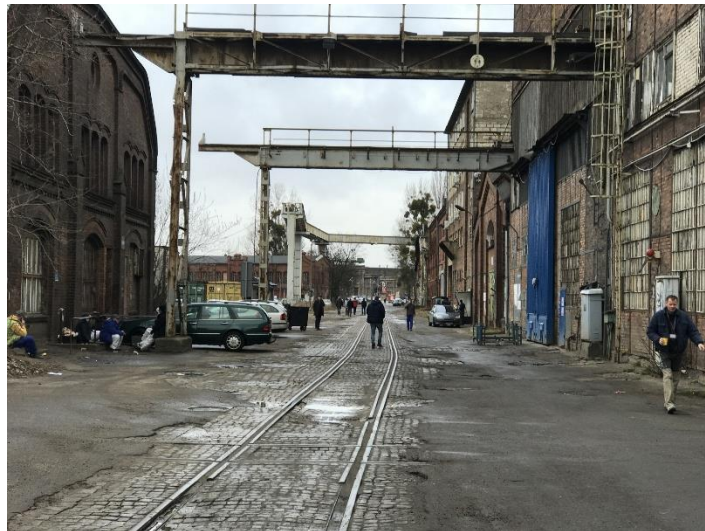
Gdansk, former shipyard.

A working visit was brought to the partially still functioning historic shipyards. Some of the IEHC's members were already familiar with the Gdansk shipyard whilst for others it was an eye-opening and memorable discovery. Our visit and our subsequent discussion helped us understand more fully the universal significance of the site as the birthplace of Solidarity and as a highly symbolic place for the fall of communist regimes in Poland and other East European countries. Where the site's industrial and technical heritage is concerned, we discovered an authentic historic landscape and authentic structures that can tell the story of a century and a half of shipbuilding in Europe. We were struck by the European dimensions of this history, from early British involvement in the 1850s, to the investment of French money after the Franco-Prussian war, to the Prussian period of the 'Imperial' shipyard, to the period of the city's independence, the Nazi occupation and, finally, the Stalinist era leading up to Solidarity.