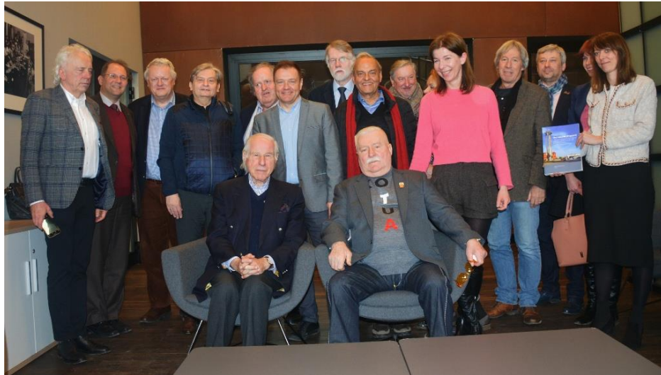
Gdansk, European Solidarity Centre, Meeting with former state president Lech Walesa.

movement against the communist dictatorship, we were now gathered in a free European democracy.